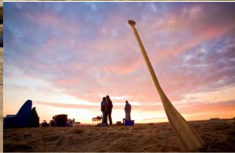
THIS PAGE, CLOCKWISE FROM TOP LEFT: THE AUTHOR, LOOKING OUT TO A TOWBOAT PUSHING FREIGHT DOWNRIVER NEAR THE MISSISSIPPI-ARKANSAS CONFLUENCE; PADDLING ALONG A BACK CHANNEL OF BUCK ISLAND, THE BEGINNING OF THE LOWER MISSISSIPPI WATER TRAIL; MORNING ON THE VAST BUCK ISLAND SANDBAR, JUST NORTH OF HELENA, ARK. OPPOSITE: CHARLES WRIGHT AND JOHN RUSKEY, RELAXING AFTER BREAKFAST ON ISLAND 64.