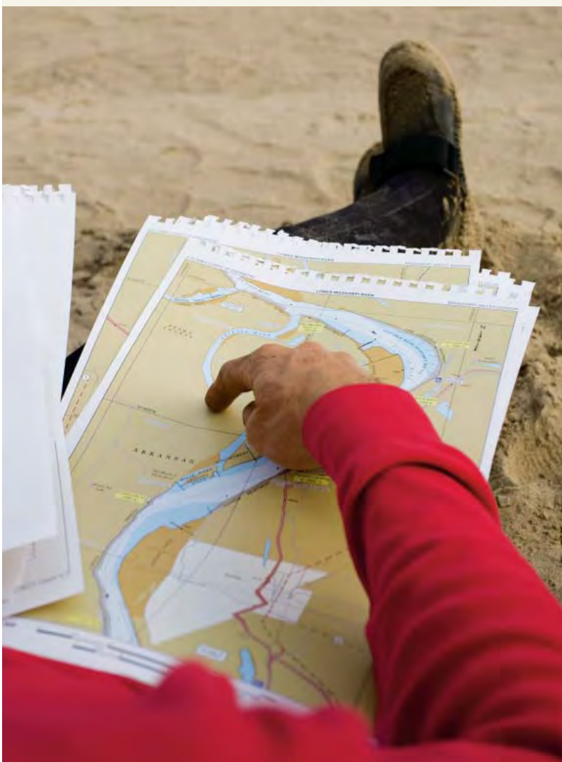
RUSKEY POINTS OUT OUR CAMP ON BIG ISLAND, ALONG AN OLD CHANNEL OF THE WHITE RIVER; JUNEBUG I, BELOW, FULLY LOADED AND TRACKING STEADILY DOWN THE MIGHTY MISSISSIPPI.